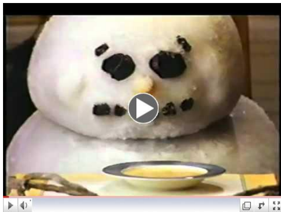
Campbell's Winter Commercial

recent years. Senior Moments and Senior Moments 2 ; both comprehensive and clearly written books for "Seniors and those who love them". They are based on weekly "Senior Moments" columns originally written for publication in the Bowie Blade-News of Bowie, Maryland and the Crofton News-Crier of Crofton, Maryland.