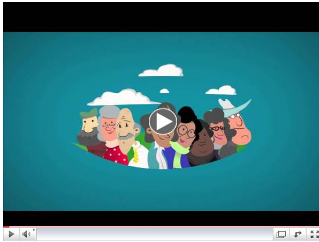
Laugh Yourself Healthy

If you are interested in having an Attorney from Byrd & Byrd speak to your organization, or at a special event, please contact us at 301-464-7448.