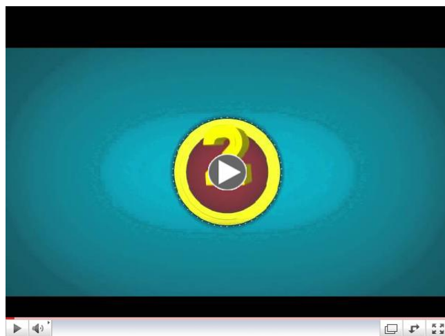
Eat your way to better brain health